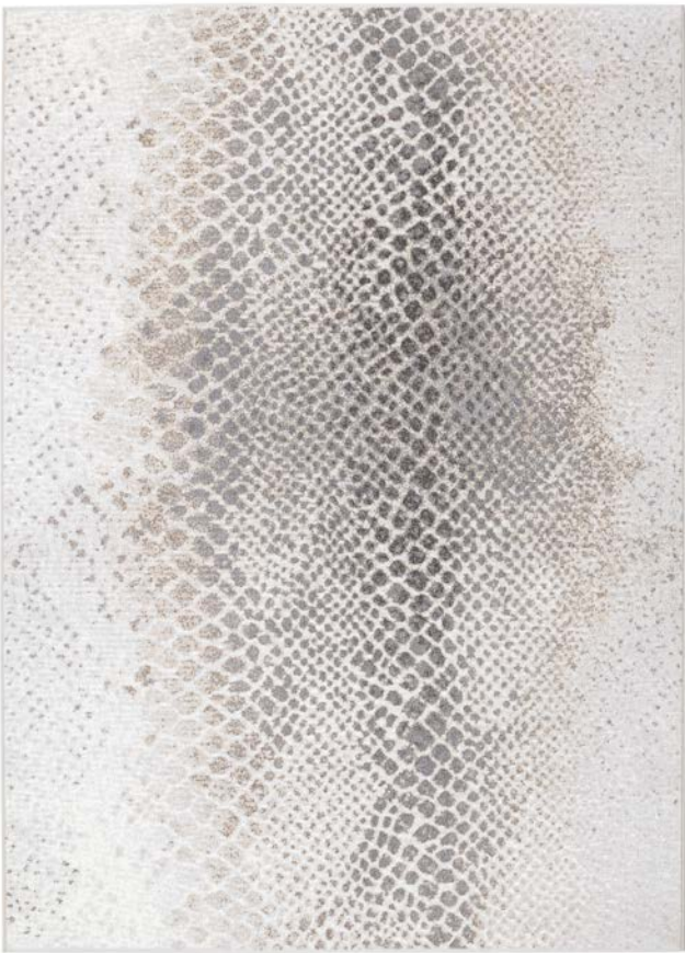
12263 / 910