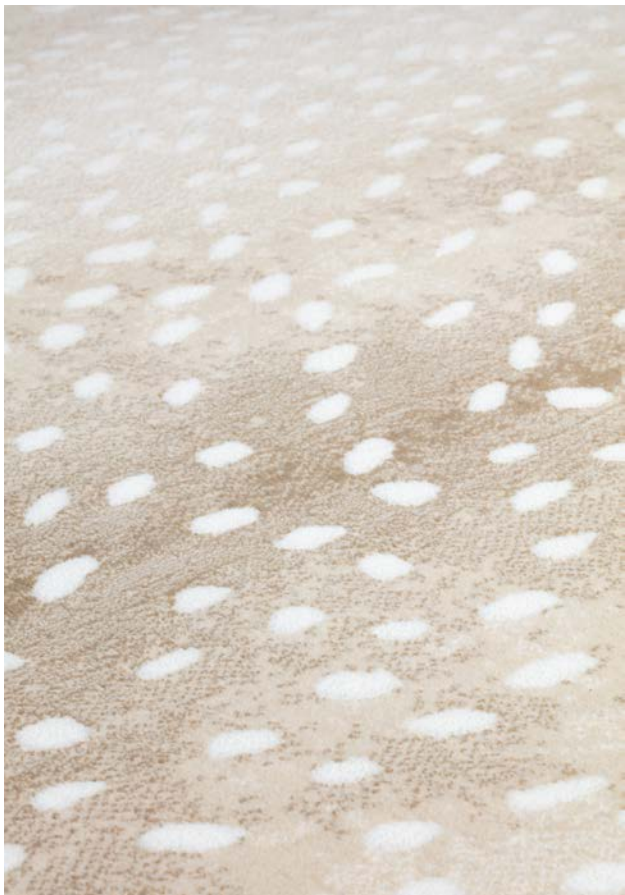
12265 / 100 close up