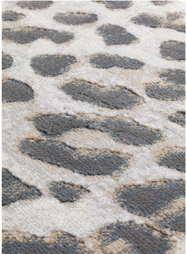
12279 / 505 close up