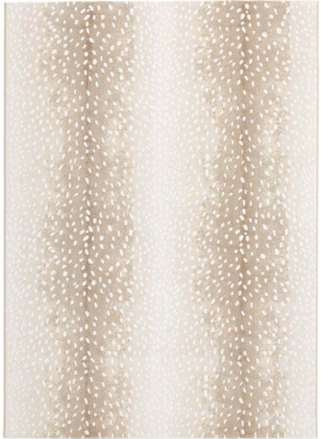
12265 / 100