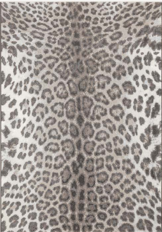
12279 / 910