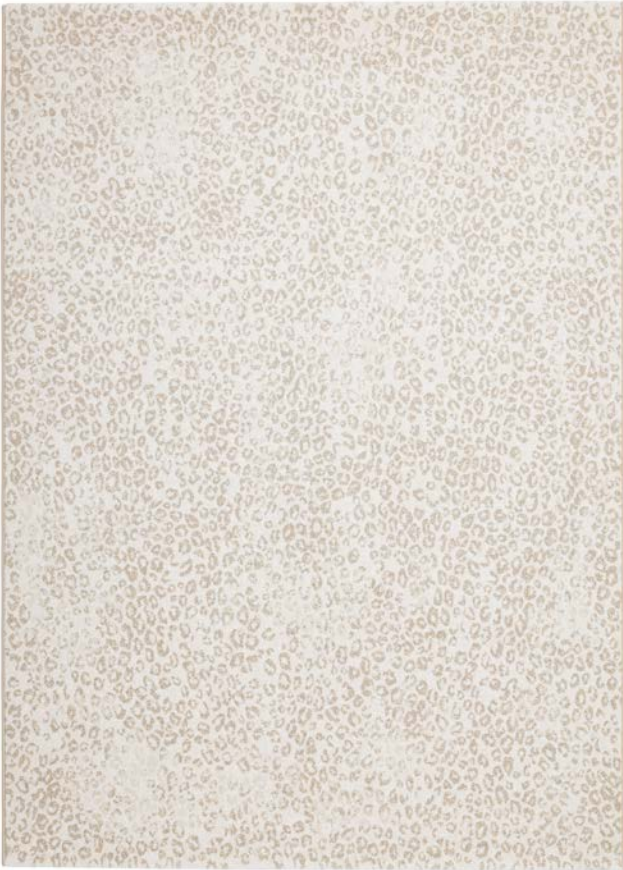
12268 / 100